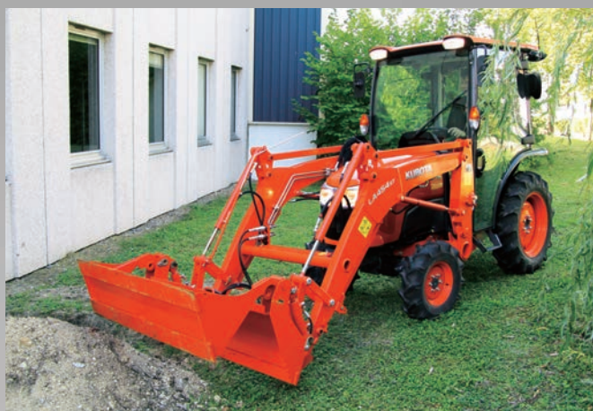
GRAPPLE BUCKET 4-IN-1