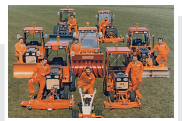
1980: Holder enters the municipal business with a broad product range.

Mechanisation in the local authorities is progressing and Holder responds with his first municipal tractor P 50.